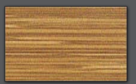
EW 6487 Rattan Cane