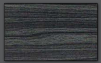
EW 9832 Equidae