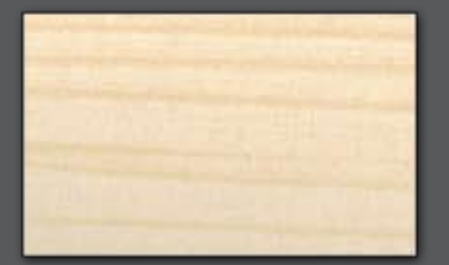
EW 6412 Light Maple