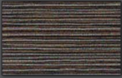
EW 6414 Clifton Wenga