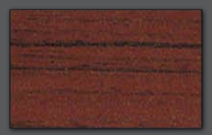
EW 9064 Mohagony