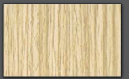
EW 6420 Legno Rovere