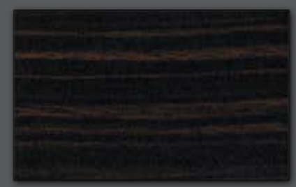
EW 5424 Rosy Ebony