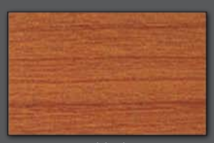
EW 6445 Wild Cherry