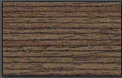
EW 6017 Piccolo Cane