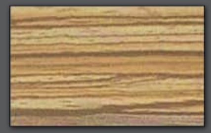
EW 9359 Light Zebra